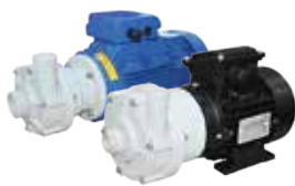
CTP plastic centrifugal pumps