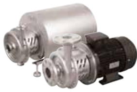
CTX centrifugal pumps