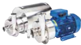
CTI & CTH centrifugal pumps