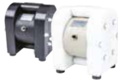
PE & PTFE pumps