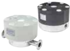
Active pulsation dampeners