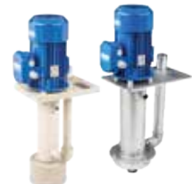
CTV vertical centrifugal pumps