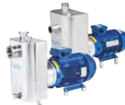
CTS self-priming centrifugal pumps