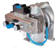
TF Filter press pumps