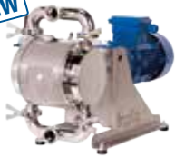
Electrically operated pumps