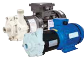
CTM magnetic drive centrifugal pumps