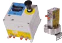
Systems & accessories