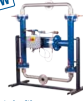
Steinle filter press pumps