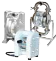
TC Intelligent pumps