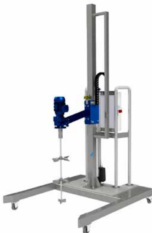
Mobile Mixing Station