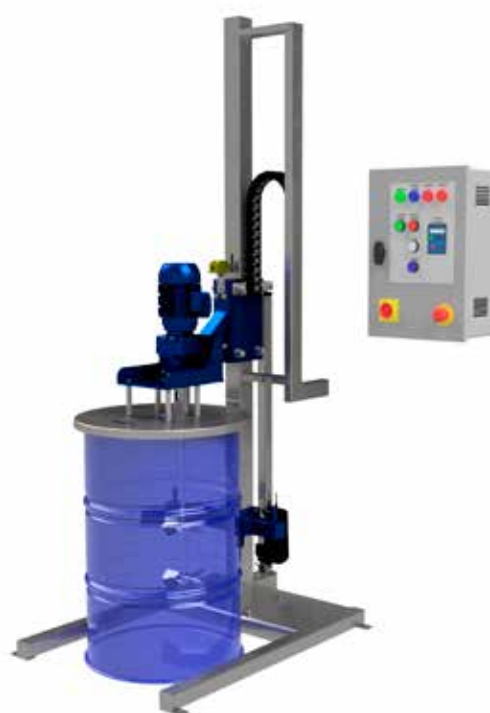
Drum Mixing Station